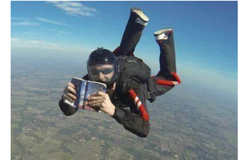
Where might you be caught reading?

This will be a celebration of the love of reading at BFJS. A whole host of activities will be on offer with more details below including author workshops, live assemblies, paired reading and much much more. It is a non-uniform day with the opportunity to create a costume linked to a book or character. We would also like to catch people reading in unusual places too - send your photos in to remotesupport@barnesfarm-jun.essex.sch.uk . There is also the option to take part in a sponsored Readathon too.