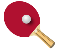
Table Tennis Team - Third in Essex!