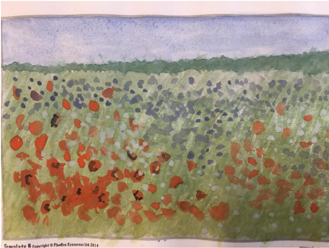
Ayesha's Monet-inspired painting