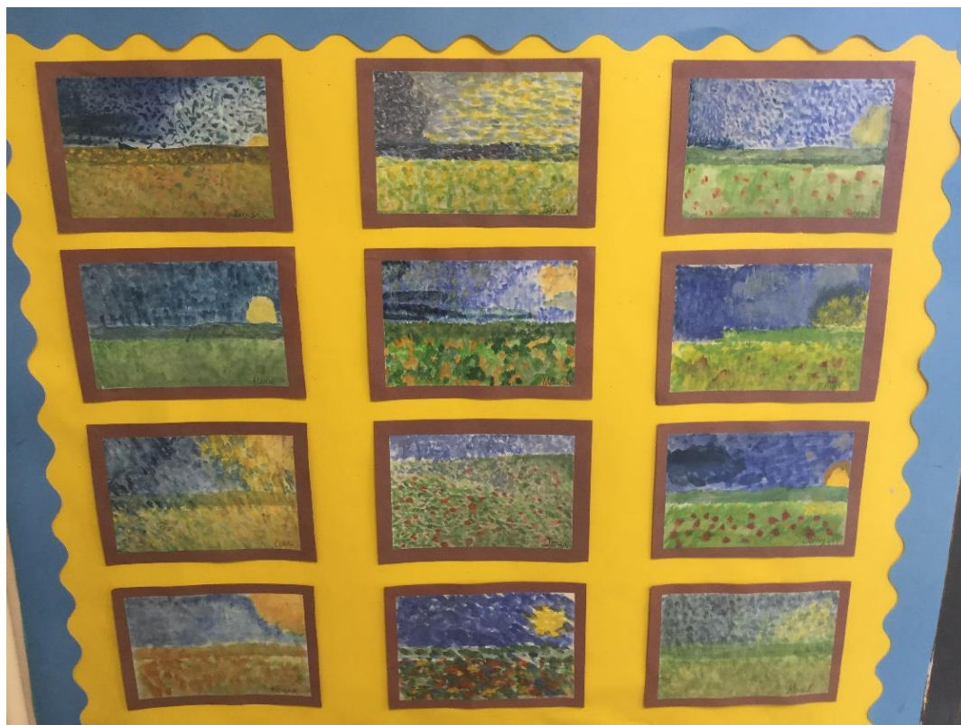
More Monet-inspired artwork from 6G Red