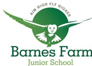
Barnes Farm Juniors